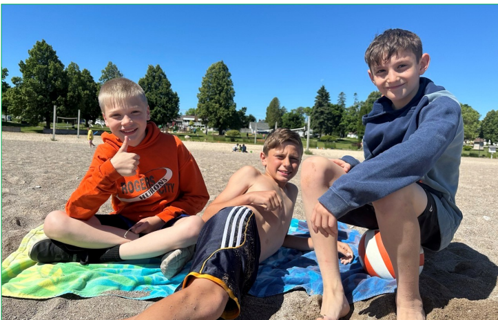
Three youth enjoy a day at the beach.