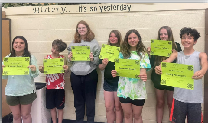
Graduating Babysitting classes: upper left, Onaway; upper right, Rogers City; and lower left is Posen.