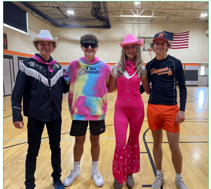
Youth instructors dressed up for Halloween in July!