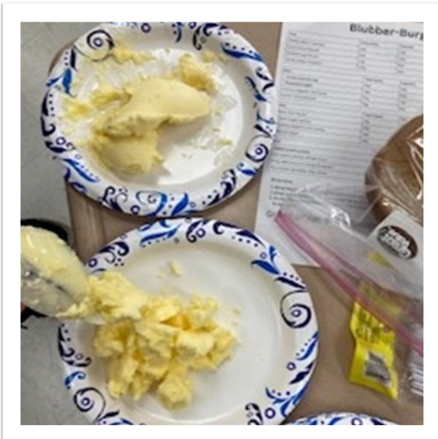
Students calculate the amount of fat in a fast food meal using shortening.

Community Nutrition Instructor Marilyn Ellenberger goes into local schools and teaches healthy and nutritious ways to snack and cook. This is just one of many programs offered by Ellenberger. Our community nutrition instructors work with local schools and community organizations to offer programs focused on nutrition and physical activity. The following pictures show one such program, Teen Cuisine, in Presque Isle County.