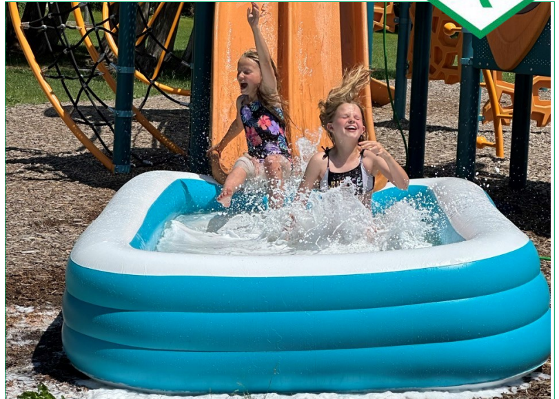
Youth enjoy the water slide which is always a hit!

This year's Summer Rec Program was truly one to remember. Not only did campers join in on exciting recreational activities and field trips, but they also engaged in fun and meaningful lessons involving environmental science and healthy living. 60 participants were enrolled in this six-week program.