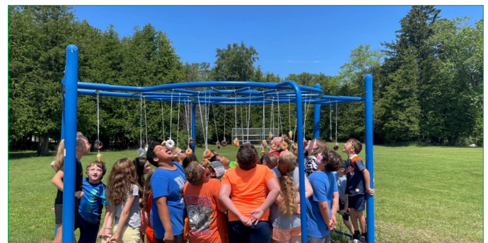
Students play a donut hang game....no hands!