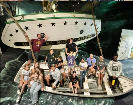
4-H Great Lakes and Natural Resources campers explore fisheries science and maritime history.