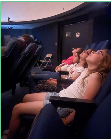
Youth enjoying views at the Besser Planetarium.