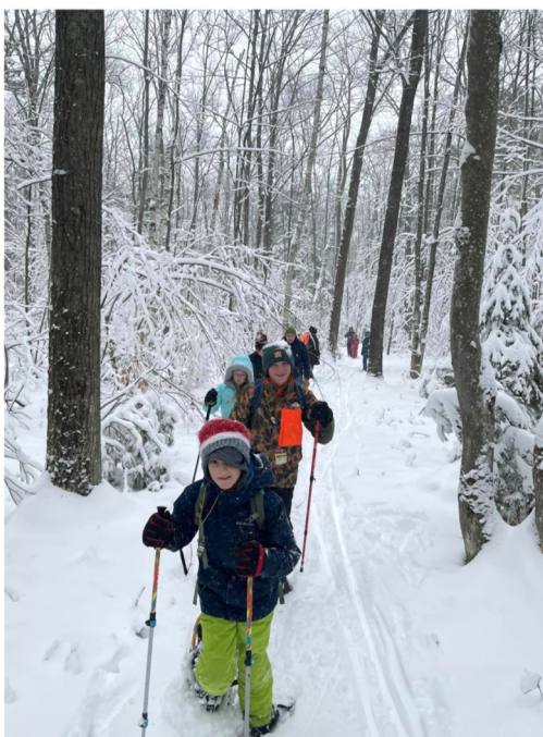
Youth having fun on a winter hike.