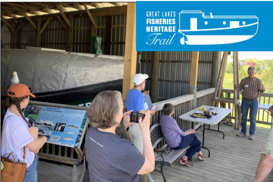
Conference attendees touring Great Lakes Fisheries Heritage exhibits at the Besser Museum.

Dedicated to the protection and sustainable use of the Great Lakes and coastal resources, Michigan Sea Grant is a cooperative program of the University of Michigan, Michigan State University, and the National Oceanic and Atmospheric Administration. Through MSU Extension, Michigan Sea Grant works with Michigan citizens, industries, and coastal communities to encourage their use, benefits, and enjoyment of Great Lakes resources that positively influences our state's economy, environment and quality of life.