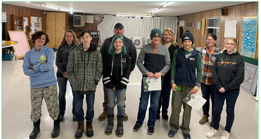
One of our many archery classes with students and volunteer leaders.