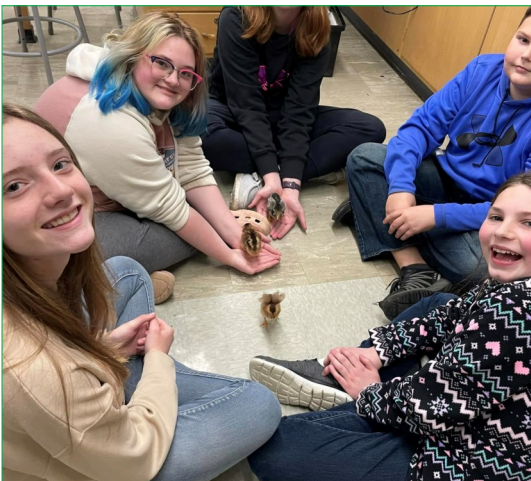
Embryology was taught in schools and three libraries throughout the county.

Some of this year's most memorable 4-H clubs and events included hiking, yoga, tree planting, embryology and archery. We are proud to share that our archery program is still going strong with over 50 youth being served during our last round of sessions. The six-session hiking club and tree planting events were gratefully enriched by a new partnership formed between 4-H and the Presque Isle Conservation District.