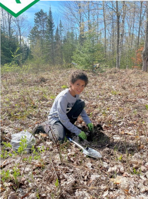
Tree planting to help preserve our local environment.

Some of this year's most memorable 4-H clubs and events included hiking, yoga, tree planting, embryology and archery. We are proud to share that our archery program is still going strong with over 50 youth being served during our last round of sessions. The six-session hiking club and tree planting events were gratefully enriched by a new partnership formed between 4-H and the Presque Isle Conservation District.