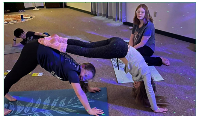
Yoga class in Rogers City.