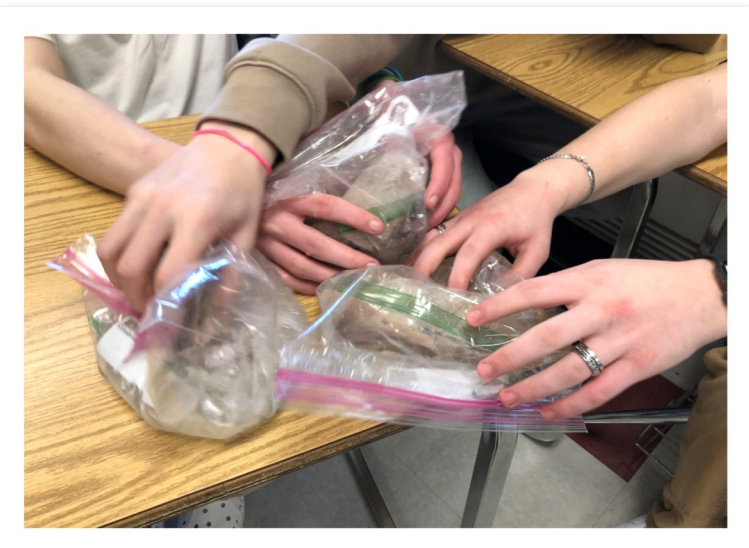
Students learned how to make a healthier version of ice cream!