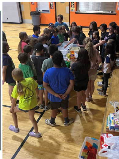
Students enjoy an Earth Science lesson.